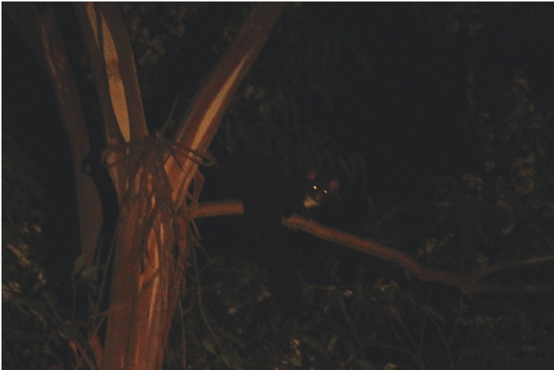
Photo: Greater Glider at GPS location 55H 0671892 5877122 (HGGT02)