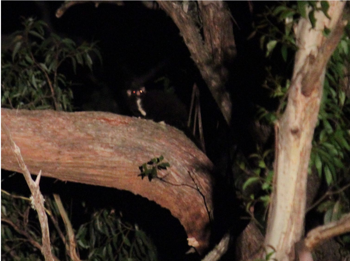
Photo: Greater Glider at GPS location 55H 0671857 5877128 (HGGT1)