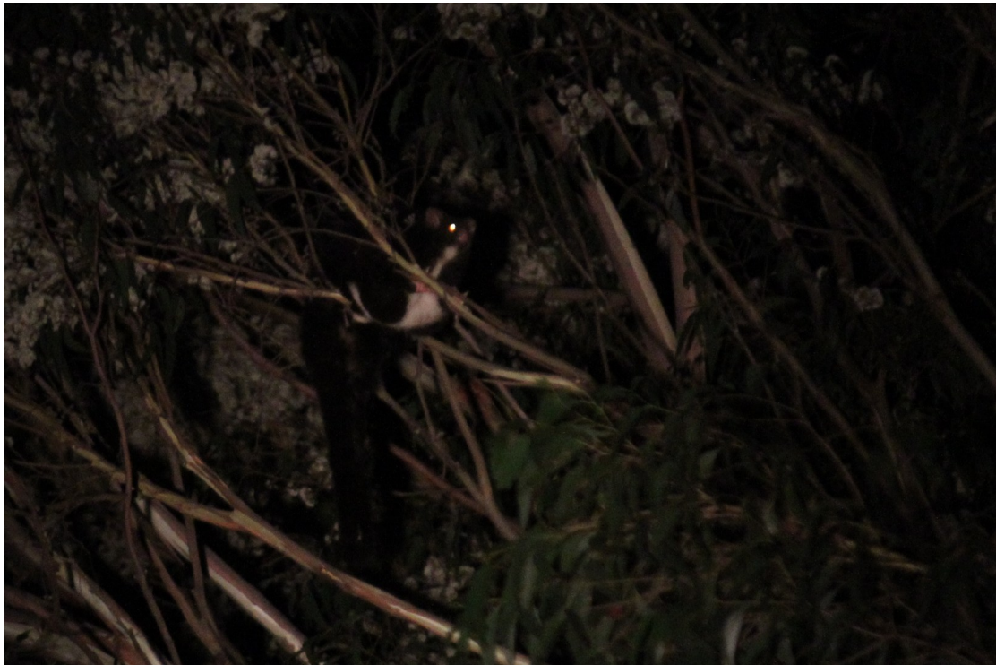
Greater Glider at GPS location 55H 0671864 5877080 (HGGT03)

GECO strongly urges the DELWP investigate this report and implement the required zoning actions as set out in the Planning Standards.