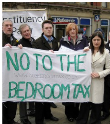
Lisa Nandy, Labour MP for Wigan