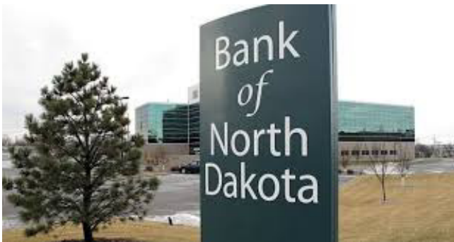
Bank of North Dakota

There are many types of banks but from a system's perspective there are two important types, they are; banks of issue and banks of deposit . The difference is quite simple, one creates money out of nothing to lend for profit and the other only lends what it has on deposit. Banks of issue practice what is known as 'fractional reserve banking' where many times the amount of money can be created than is held on deposit. This is how the banks in the Federal Reserve System operate. In ancient times such practice was condemned by religions and philosophers as usury, the abuse of monetary authority for personal gain. We feel these are important distinctions.