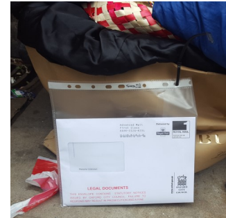
One of the Oxford City Council notices left on a homeless person's belongings threatening a £2,500 fine.