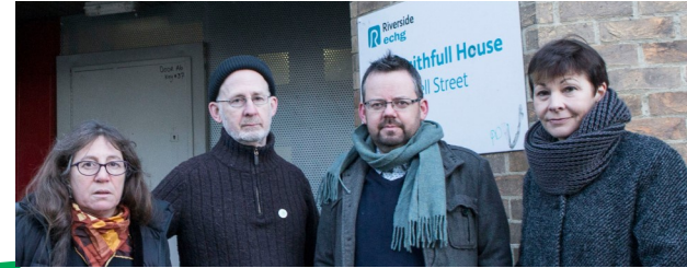
Green MP Caroline Lucas campaigning with local Green Councillors and candidates to keep the City-owned Lucy Faithfull House homeless hostel open.