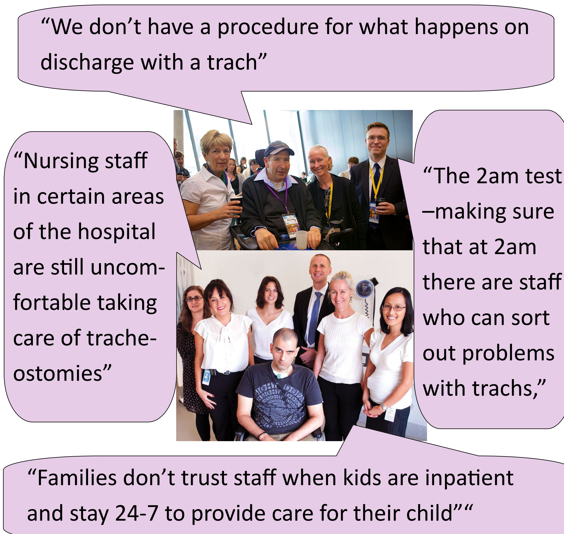
Figure 2: Qualitative survey comments from site representatives who attended the GTC launch meetings

Measurement of improvement: Analysis of GTC membership and attendance at the launch meetings was performed. Member hospitals have started prospective data entry on diagnosis, process measures, and outcomes, such as mortality and tracheostomy complications into our secure database. Qualitative interviews were conducted with care teams from 16 member hospitals and surveys were distributed to patients and families.