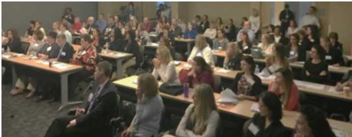
Patient and Family Session, 3rd International Tracheostomy Symposium, April 2016, Baltimore USA.

Audience and speakers' stories of challenges and triumphs generated in depth discussion and made us want to learn from each other as we strive for better care.