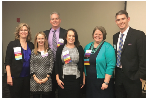
GTC P&F Committee at the 3rd International Tracheostomy Symposium in Baltimore USA 2016.

The GTC Patient & Family Committee has champions from all over the world committed to working closely with patients and families to improve tracheostomy care around the globe through the GTC and promoting the patient experience.