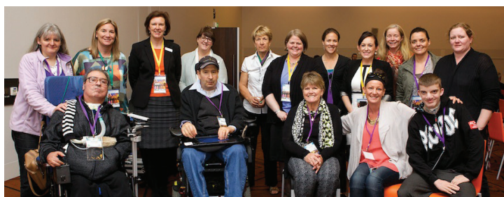
Australasian GTC Kickoff Oct 8th 2014; Melbourne, Australia

Last year, GTC Kickoffs were held in Baltimore, USA and Milan, Italy. The USA Kickoff was jointly held with the 3rd International Tracheostomy Symposium at Johns Hopkins in Baltimore, Maryland, USA . At this exciting meeting patients, families and health