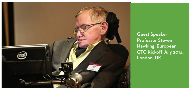
Guest Speaker Professor Steven Hawking, European GTC Kickoff July 2014, London, UK.

The 'kickoffs' are primarily about raising awareness of the GTC and getting hospitals to participate in the GTC's exciting mission to bring health professionals, patients and families together to collaborate and create better care everywhere.