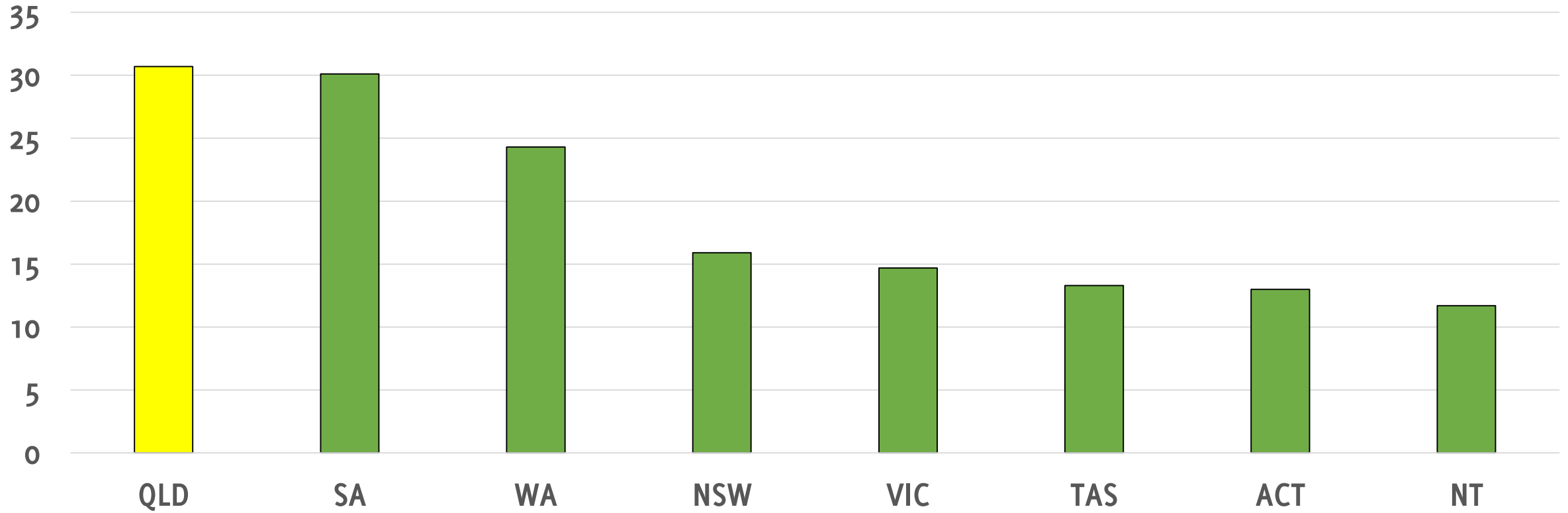
Percentage of Dwellings with a PV System