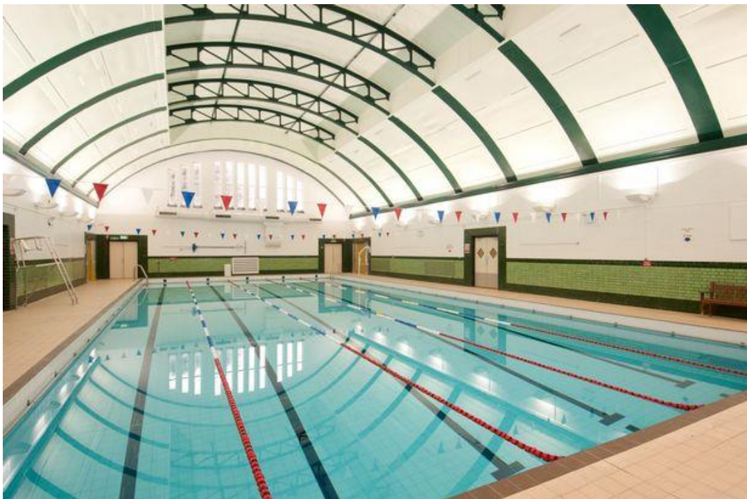
Jubilee Pool in Knowle

Responses to this consultation will help inform the investment decisions and the procurement framework for a leisure centre operator when the current contract expires in March 2022.