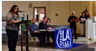
One LA increasing access for mental health services

Leveraged support of LA County Board of Supervisors in CA to provide access to mental health services for 150,000 low-income, undocumented residents.