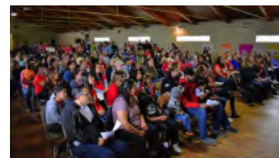
Colorado IAF securing commitments from Denver Public School Board

Working with the local teachers union, Colorado IAF secured support from members of the school board for increases in teacher pay, resulting in a 11% raise for teachers in 2019.