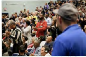
1,400 VOICE leaders celebrate Gov. Northam's commitment to restoring Suspended Drivers Licenses

Secured commitments from VA Governor & Attorney General to make ending cash bail, raising the felony level, eliminating excessive court fees & fines and restoring driver's licenses for 654,000 Virginians central issues in the VA 2019 statewide elections.