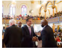
NY Governor Cuomo commits state funds for new senior housing

Won $2.2 billion to repair NYC Public Housing Authority (NYCHA) units where 500,000 black and brown New Yorkers live with mold, rats, no heat and other code violations; Forced NYCHA to agree to tough new standards for fixing mold and leaks in the 186,000 units of NYCHA public housing. Secured $500 million from NYC Mayor Bill de Blasio and City Council to begin construction on 15,000 senior units on vacant NYCHA land, which will free up NYCHA units for 150,000 low income New Yorkers.