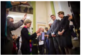
Greater Boston Interfaith Organization

Communities Organized for Relational Power in Action secured another $2 million from Monterey County, CA for full-scope healthcare for undocumented residents.