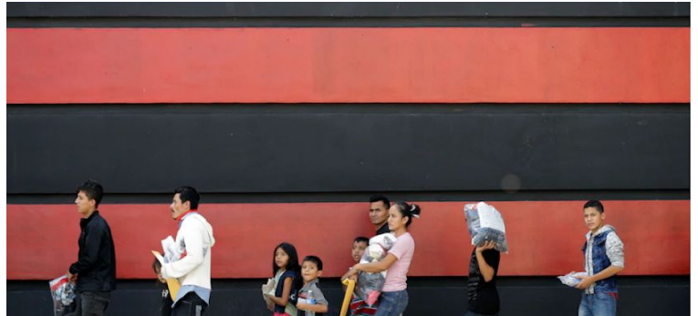
Immigrant families walk to a respite center after they were processed and released by U.S. Customs and Border Protection in June 2018 in McAllen, Tex.

Texas is at an inflection point with this census as a result of the state’s explosive growth during the past decade. The state could gain as many as three or four members of Congress, but determining the