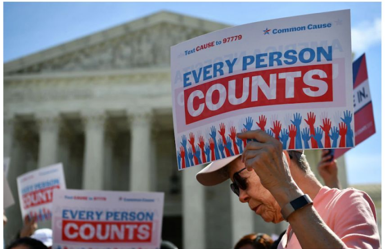
Demonstrators rally at the Supreme Court in April 2019 to protest a proposal to add a citizenship question to the 2020 Census.

Excluding undocumented migrants from the decennial counting of people who live within U.S. borders could have significant consequences in Texas, home to an estimated 1.6 million undocumented immigrants and massive demographic shifts since 2010, according to the U.S. Census Bureau and the Migration Policy Institute. Some experts estimate the true number is closer to 2 million, and more than 107,000 DACA (Deferred Action for Childhood Arrivals) recipients reside in the state.