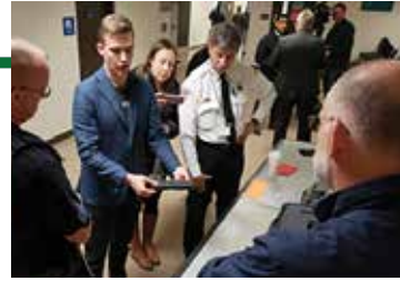
Common Ground Gun Safety Tech Expo

IAF's Do Not Stand Idly By (DNSIB) campaign organized a Gun Safety Tech Expo in Milwaukee, WI to press for responsible conduct in the gun industry. • DNSIB recruited a team of mayors and other local officials from CT, IL, MD, OH, and PA to launch the Gun Safety Consortium—the nation's first coalition of cities and counties dedicated to getting effective gun locks and safety products into the hands of police and civilian gun owners. • DNSIB also won public commitment from Chicago, IL Mayor Lori Lightfoot to work on safer guns, gun locks, and gun dealer reforms. • NJ Governor Phil Murphy and AG Gurbir Grewal signed onto the DNSIB campaign, becoming the first state to release data showing the manufacturers of guns used in crimes in the state. • Secured commitments from mayoral candidates in Houston, TX for handgun retail secure storage ordinance and public safety education campaign.