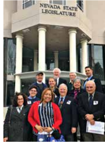
Winning payday reform in Nevada