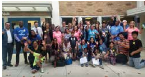
Action In Montgomery wins $60 million to rebuild schools

pollute the Beacon Academy playground with debris. • In Boston, MA , Somali leaders secured $100,000 to improve playground space.