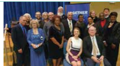
Together Baton Rouge GOTV Leaders

Through an innovative voter engagement strategy, LA leaders boosted voter turnout from 46% statewide to almost 51% by targeting traditionally low-turnout neighborhoods. In Shreveport, Alexandria, Baton Rouge and New Orleans, voter turnout increased by an even greater amount. • From 2017 - 2019, 1,332 leaders in VA knocked on their neighbors' doors for the Virginia elections. Secured major results in 2019 through our nonpartisan GOTV work in low voter turnout swing districts in VA . Each year, Metro VA leaders have significantly increased voter turnout over other similar precincts.