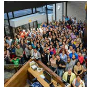
Dallas Area Interfaith - Recognizing the Stranger Training

Issued thousands of Parish Identification Cards to serve as accepted alternative forms of ID for immigrants in their communities