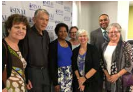
Metro IL celebrates the opening of Crisis Stabilization Unit

Restored drivers' licenses to 627,000 Virginians with unpaid court fees and fines. • Won a commitment to create a public defender office in Prince William County, VA , the first county to be a majority people of color county in VA . • Created alternatives to incarceration for people of color in Cleveland, OH by expanding access to Drug Court. • Won Clean Slate legislation introduction to wipe criminal records clean upon release in CT . • Won increase in Medicare/Medicaid funding for newly established Crisis Stabilization Units (CSU) in IL .