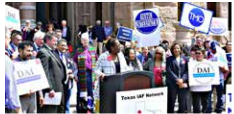
Texas IAF restoring funding for long-term labor market intermediaries

Increased wages from $12 to $14 per hour for 3,000 of the lowest-paid Houston Independent School District workers in TX . • Negotiated an average $9,000/year pay raise for teachers in Denver, CO . • Increased hourly wages from $8.40 to $15.00 for Alamo Community College workers in San Antonio, TX . • Texas IAF restored $4.5 million in state funding for long-term labor market intermediaries that move