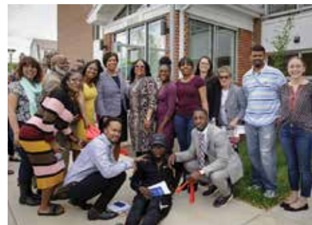
WIN celebrates opening of affordable housing units

• Celebrated the opening of 99 new affordable housing units in DC . • Delivered win to homebuyers in MA with $3.8 million in assistance towards a combination of lower interest rates and enhanced down-payment assistance.