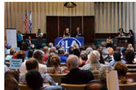
One LA-IAF working for change

Won sweeping reform in CA including: protection against eviction and rent increases for over 45,000 renters; mandatory mediation; and $20 million in funding for "Right to Counsel" programs. • Leveraged $1 million in displacement mitigation for displaced and vulnerable residents in San Antonio, TX . • Secured Fair Housing Law in Anne Arundel County, MD that removed discrimination based on forms of payment and won establishment of Human Relations Committee that has authority to subpoena landlords who violate the Fair Housing Law.