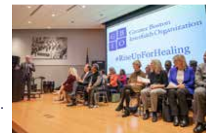
Greater Boston Interfaith Organization lowering prescription drug costs in MA

low-income people from low-paying work to high demand careers. • In San Antonio, Project QUEST gained national recognition for its multi-decade success in changing lives through long-term job training. • Leveraged more than $3.7 million in public dollars for labor market intermediary Capital Idea in TX and won $25,000 in new county funding for workforce development. • BUILD's Turnaround Tuesday movement in Baltimore, MD secured nearly $3 million in funding to develop quality jobs through 2024, and added 214 job placements in 2019 for a total of over 757 since its inception. • Won $15 per hr hourly wage requirements for all Housing Authority jobs in Durham, NC (prioritizing public housing resident hiring), for all jobs generated by a $95 million housing bond and $17.5 million construction of Durham's Belt Line Project, and for Duke University jobs. • Won commitment to double size of youth employment program in Durham, NC .