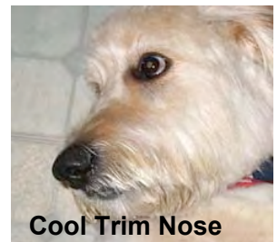
Cool Trim Nose