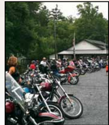
Over 100 Motorcyclists Participated!