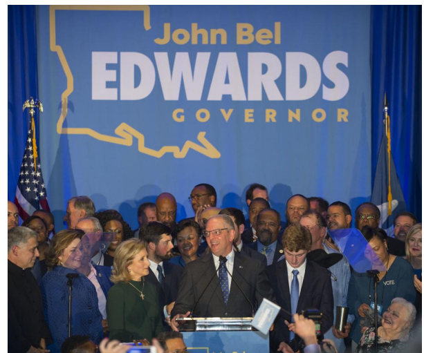
Video: In victory speech, John Bel Edwards addresses President Trump: 'God bless his heart'

Edwards won re-election by rolling up big margins in New Orleans, Baton Rouge and Shreveport – all cities governed by African-American mayors – while winning or holding his own in suburbs of New Orleans that had overwhelmingly voted Republican in 2003 when the last Democrat, Kathleen Blanco, was elected governor.