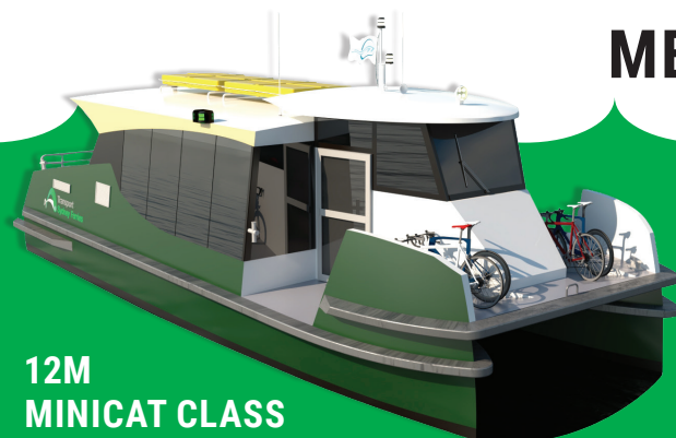
12M MINICAT CLASS