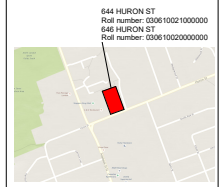
SITE KEY MAP

CONTRACTOR SHALL CHECK ALL DRAWINGS ON THE WORK AND REPORT ANY DISCREPANCY TO THE ARCHITECT BEFORE PROCEEDING. ALL DRAWINGS AND SPECIFICATIONS ARE THE PROPERTY OF THE ARCHITECT AND MUST BE RETURNED AT THE COMPLETION OF THE WORK. DRAWINGS ARE TO BE READ AND NOT SCALED.