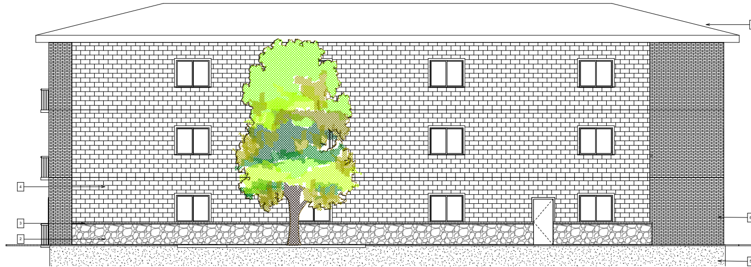
① EAST ELEVATION 1 : 50