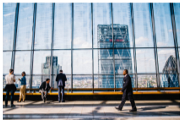
Shell companies facilitate crime and fraud.

ensure that companies formed in the U.S. disclose their true owners. This will make it much easier for law enforce-