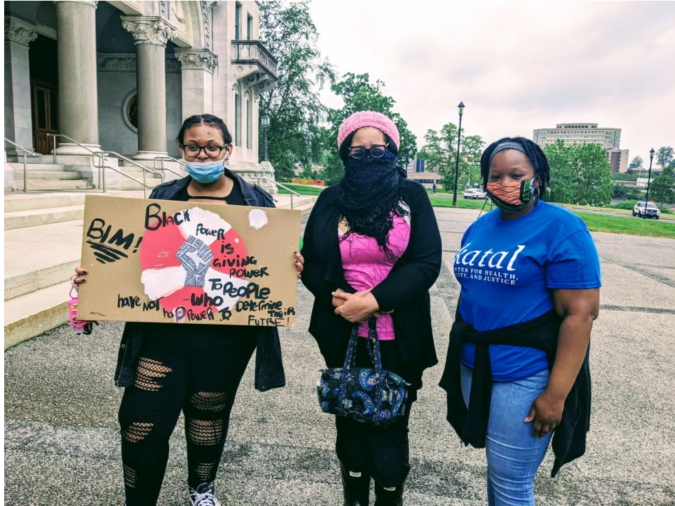
Katal members and allies at a rally at the state capitol in Hartford demanding that lawmakers address systemic racism

In the midst of the pandemic and ongoing rebellion over systemic racism, the Connecticut General Assembly and the New York State Legislature are both returning this month for “special sessions.” But ending mass incarceration and addressing COVID-19 in prisons and jails are not yet on the agenda in either state. We are fighting to change that.