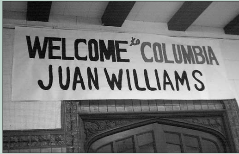
Columbia HS Students warmly welcomed Juan Williams