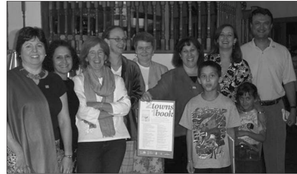
Two Towns: One Book 2004 brought together community