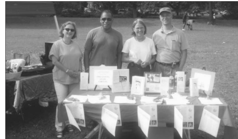
Coalition trustees and committee members host tables at public events to share information