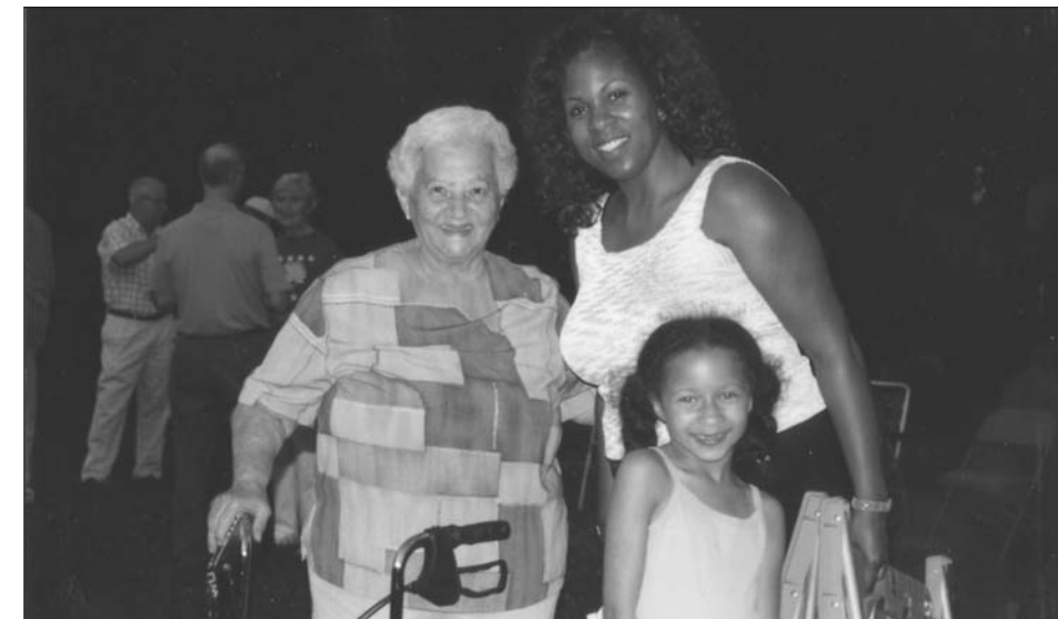
Residents of all ages enjoy the annual Celebration of Vision