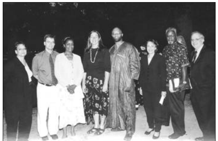
Clergy and Interfaith Outreach Committee members enjoy the "Celebration of Vision."