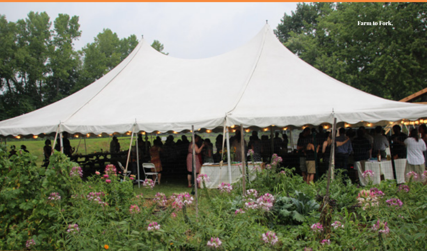
Farm to Fork.