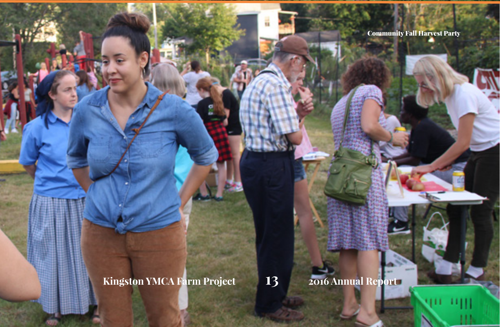
Community Fall Harvest Party