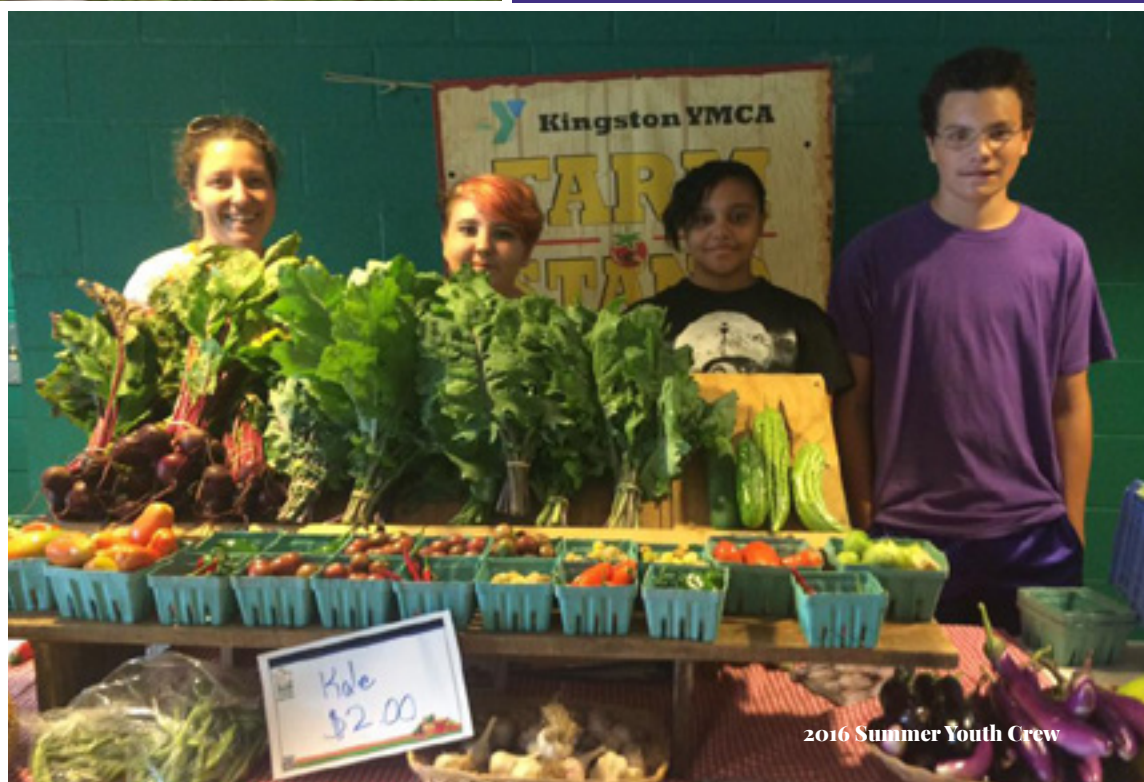
2016 Summer Youth Crew