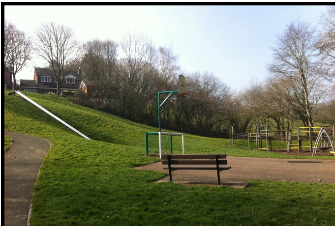
Great Hill View Play Area, just one of our important community play areas.