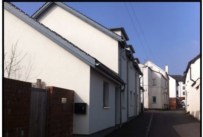
Council built, low-energy homes, providing new homes and reducing fuel poverty.