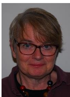
Trade Union Liaison