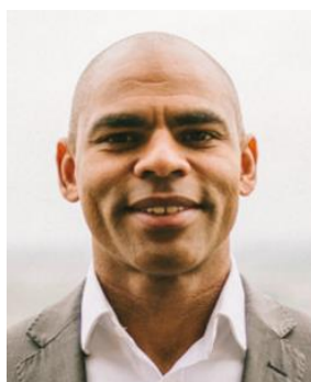
Mayor of Bristol