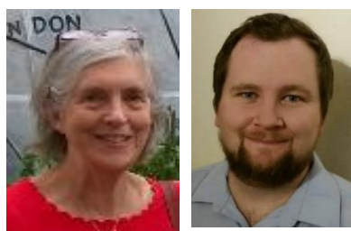
Delegates to the LCF Executive Committee