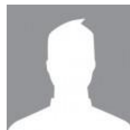
Labour Group Observer