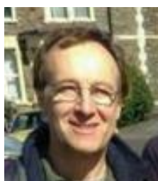
Ward Organiser Officer