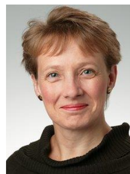
Member of the European Parliament for South West