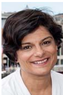
Member of Parliament for Bristol West