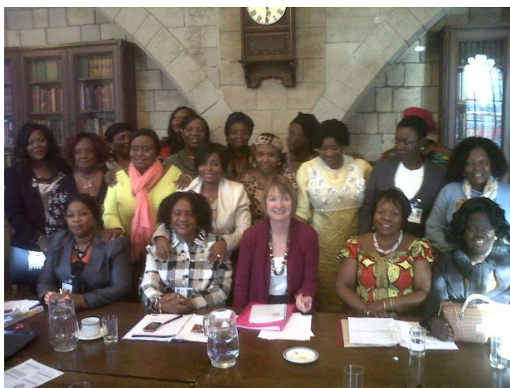
Meeting a group of women MP's from Ghana and Sierra Leone visiting the UK Parliament in April