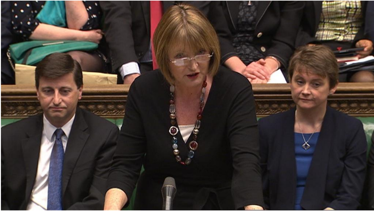
Challenging the Government at the Despatch Box

As Shadow Secretary of State for Culture, Media and Sport , I speak up for the importance of the arts, culture and sport; develop Labour's policies; and hold the Government to account.