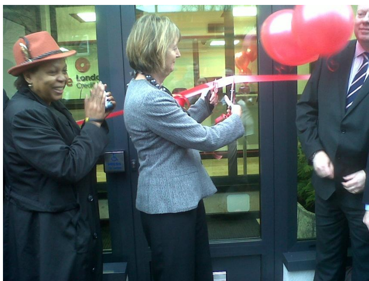
Opening the new Peckham HQ of the London Mutual Credit Union in January

More and more people feel forced to go to pay day lenders for loans to help pay for everyday essentials. The London Mutual Credit Union (LMCU) offers people an affordable alternative and I was pleased to open their new head office in Peckham in January. Staffed by local people, it offers a range of services including alternative 'payday' loans costing a fraction of the rate loan sharks charge. Ed Miliband chose to announce Labour's plan to impose a levy on payday lenders at the same branch on October 17 th . The money raised from the levy would be used to double the amount of public funding for low-cost alternatives, such as credit unions.