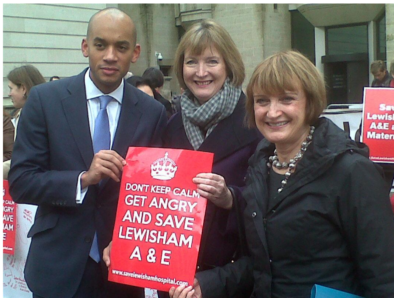
Tessa Jowell, Chuka Umunna and myself campaigning to save Lewisham Hospital

I joined supporters of the Campaign to Save Lewisham A&E and maternity services outside the Ministry for Health in January to hand a petition to the Health Secretary, Jeremy Hunt MP. Following his announcement to downgrade Lewisham A&E and close maternity services, I wrote a joint letter with fellow South London MP's to express my concerns about the devastating impact these cuts will have on King's College Hospital - which is already overstretched - with more patients having to come to King's. We have fought a long hard campaign to save Lewisham hospital. The High Court ruled that Jeremy Hunt's decision was outside his remit as Health Secretary. The Secretary of State appealed but lost that appeal on the 29 th October. My job as your local MP is to protect our NHS services, and on this one we fought to win, and we succeeded.