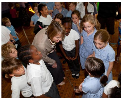
Talking with children from St Johns' & St Clements Primary School