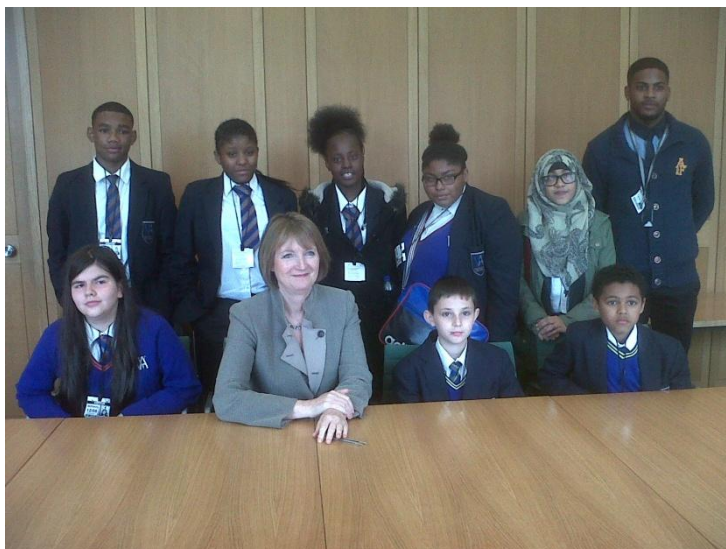
Meeting students from Walworth Academy at the House of Commons