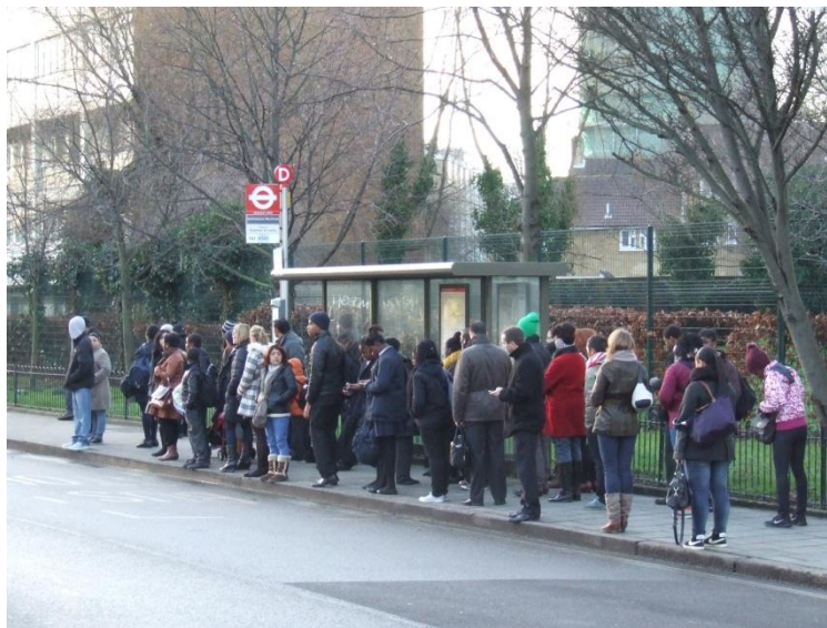
Commuters waiting for the 343 bus during the morning rush hour on Southampton Way