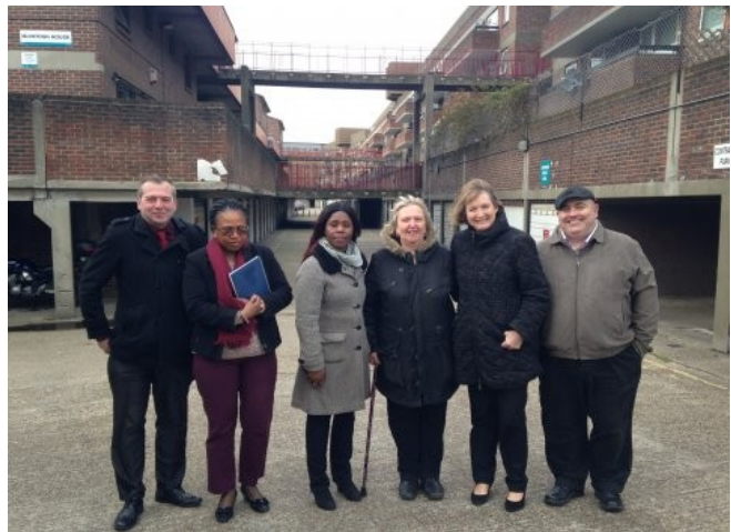
Visiting the Silverlock Estate in March