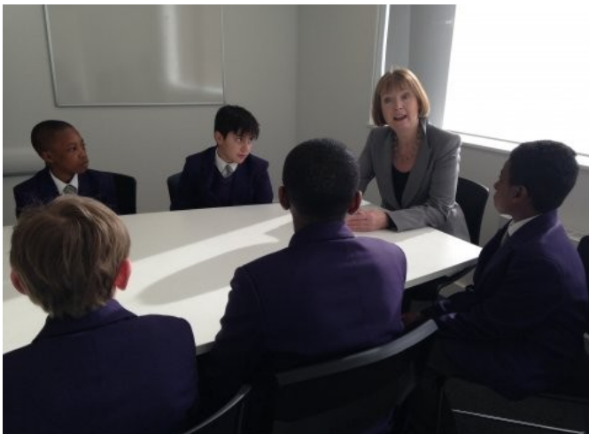
Visiting ARK All Saints Academy