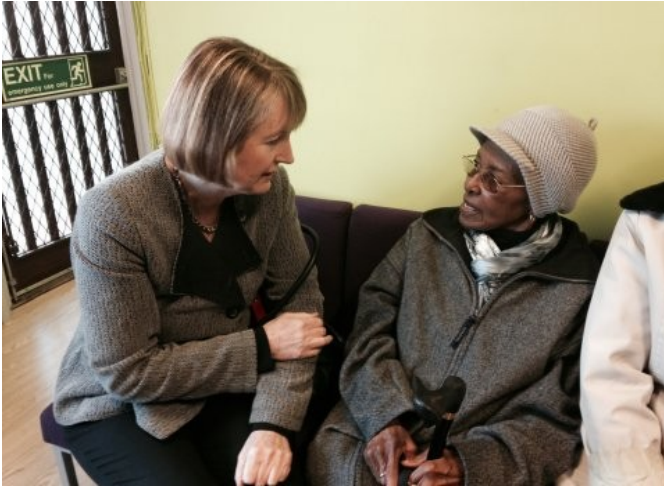
Meeting with a local pensioner at the newly re-opened Southwark Pensioners' Centre