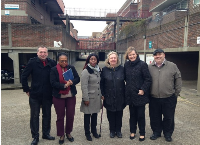
Visit to the Silverlock Estate