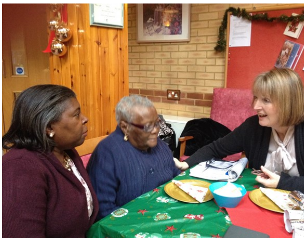
Talking to service users and their families at the Dementia Memory Cafe