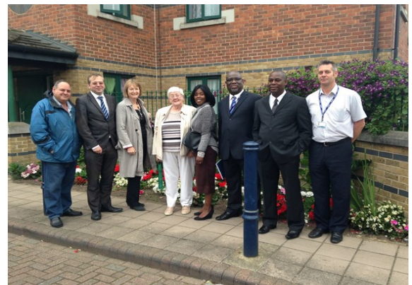
Visit to the Bonamy Estate