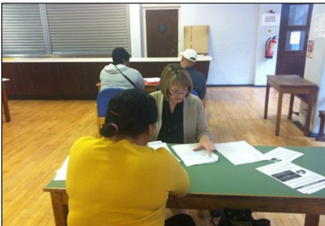
Speaking to a constituent at an advice surgery