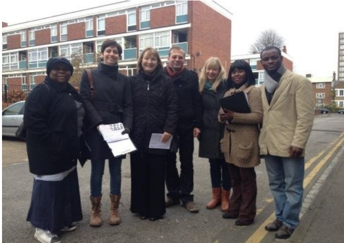
Campaigning on the Lindley Estate with local council candidates in November