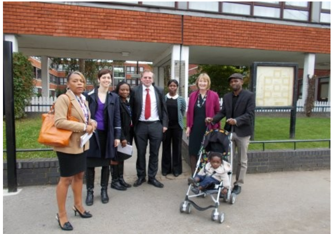
Visiting Acorn Estate in October