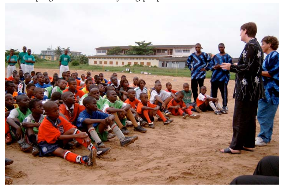
The Community Action through Sport Project in Lagos

There is still controversy in Nigeria about whether the issue of the transmission of HIV through sexual activity should be directly addressed or whether instead chastity and abstention should be promoted. The policy of the Federal government and the network of community, youth and health NGOs is to tackle the issue openly. At CATS (Community Action Through Sport) a Lagos-based out-of-school sports project for young people, I saw the message about HIV avoidance through the use of condoms, playing a central part of their programme with the young people.