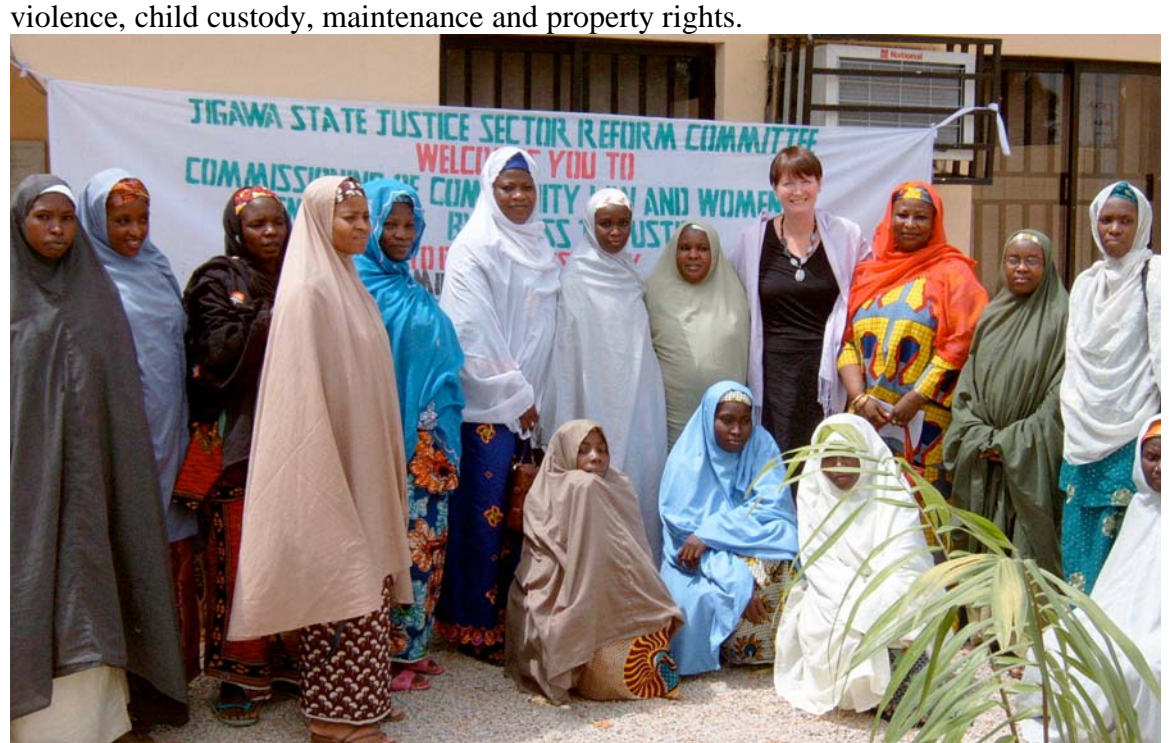
The Women's Research and Legal Advice Centre in Dutse, Jigawa State, Northern Nigeria

democracy and human rights. This is of concern both in the South of Nigeria and also in the North, whose law is based on Sharia. The Northern state of Jigawa, for example, is working to improve access to the law in remote rural communities and in particular for women to get their legal rights, by establishing a Women's Research and Legal Advice Centre in Dutse, which I opened during my visit. This is supported by the British Council Security Justice and Growth programme. The women I met there said most of the issues of concern to women arose from marital disputes, particularly domestic