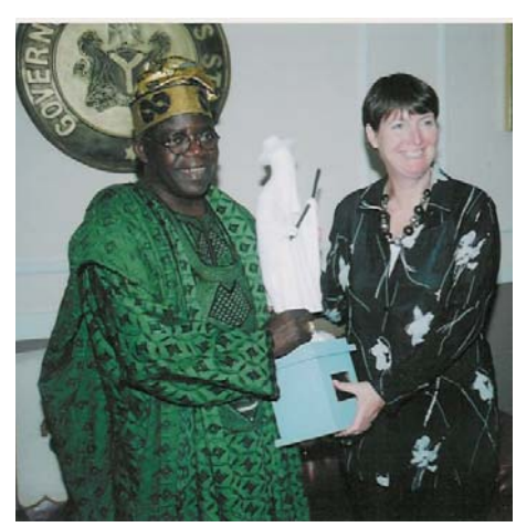
With the Governor of Lagos