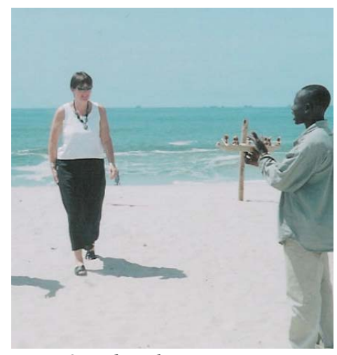
On a beach in Lagos

Visit Community School in outskirts of Kano Roundtable on Women's Rights under Sharia Visit British Council