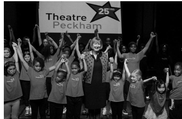
With students at Theatre Peckham