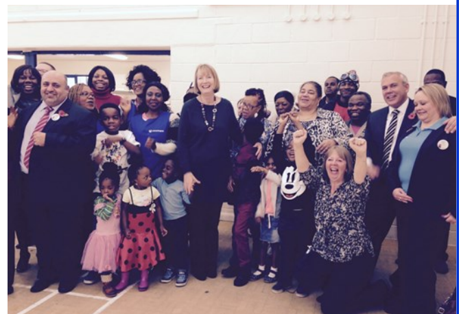
At the Wickway Centre, Peckham

I was contacted by the grandson of an elderly couple from Peckham whose boiler was causing them problems. The boiler had a faulty timer which would automatically switch off their heating all night during the winter months but remain switched on during the summer months. Because they could not keep their heating on during the cold winter nights they were struggling to keep warm especially as they had existing medical problems. I wrote to the council about this and they sent an engineer to remove the timer and set a manual control. Their heaters were also replaced. They are now able to control their heating and adjust it according to their needs.