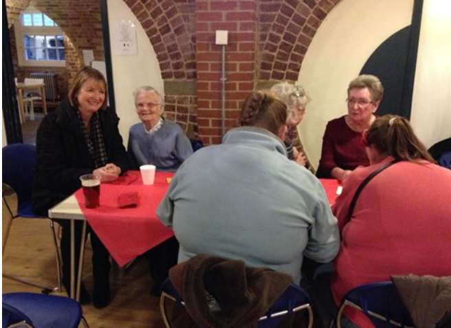
Christmas lunch with the Walworth Estate Tenants and Residents Association

Since the General Election in May 2010 I have taken up cases on behalf of over 10,000 people living in my constituency.