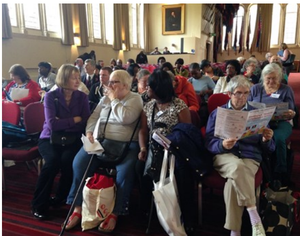
At the Southwark Tenants Conference in Camberwell