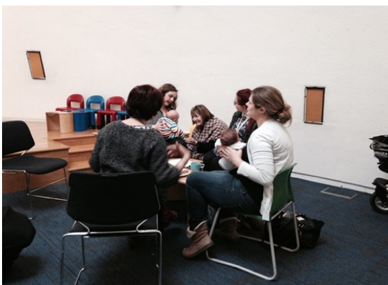
With parents at the Peckham Library Baby & Toddler Group