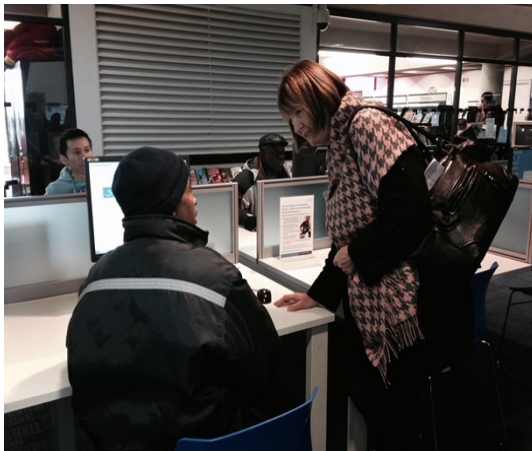
With a service user at Peckham Library

Since the General Election in May 2010 I have taken up cases on behalf of over 10, 000 people living in my constituency.