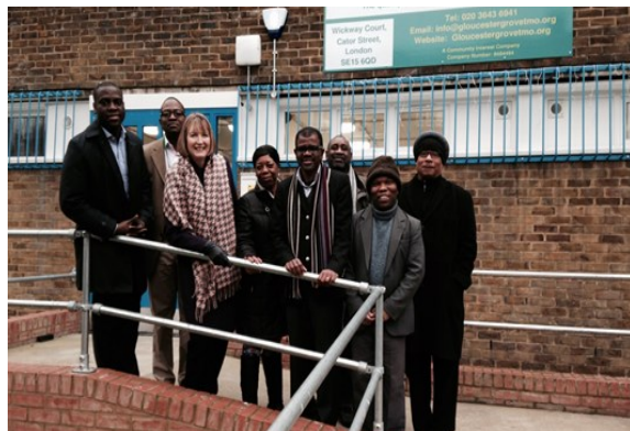
Visit to the Gloucester Grove Estate