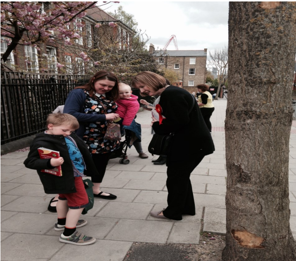
Meeting parents and pupils after school outside Lyndhurst Primary School