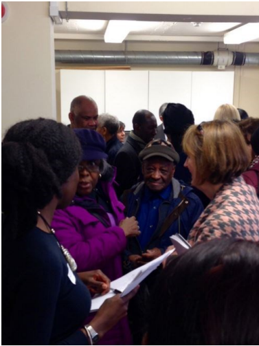
Coffee morning with tenants and residents on the Brayards Road Estate in March 2016