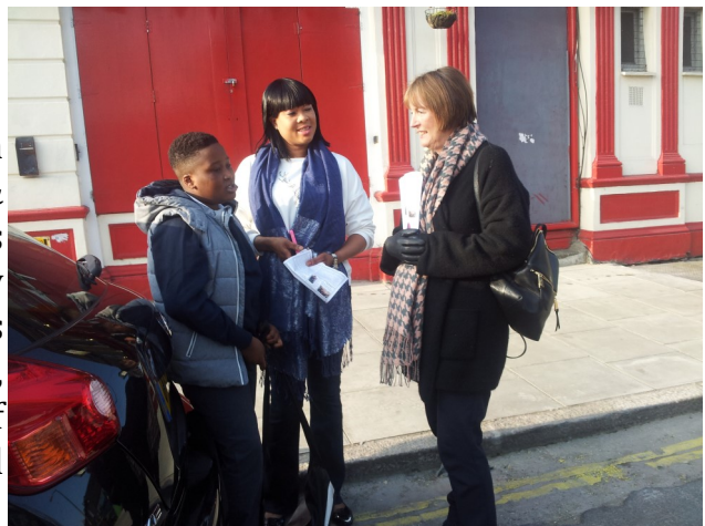
Meeting parents and pupils at St George's C of E Primary School in Camberwell in March 2017.