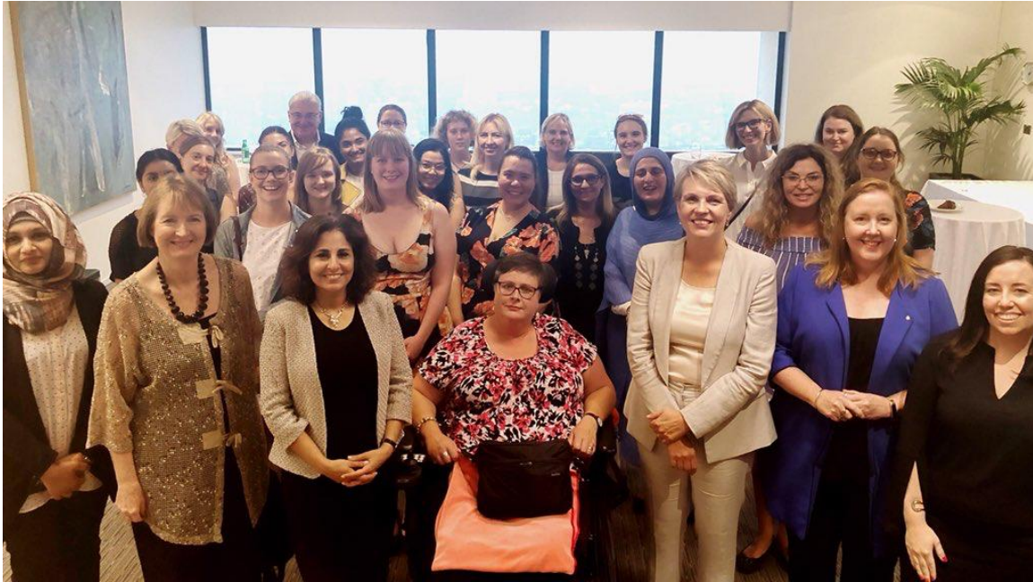
New South Wales Labor Women's Forum