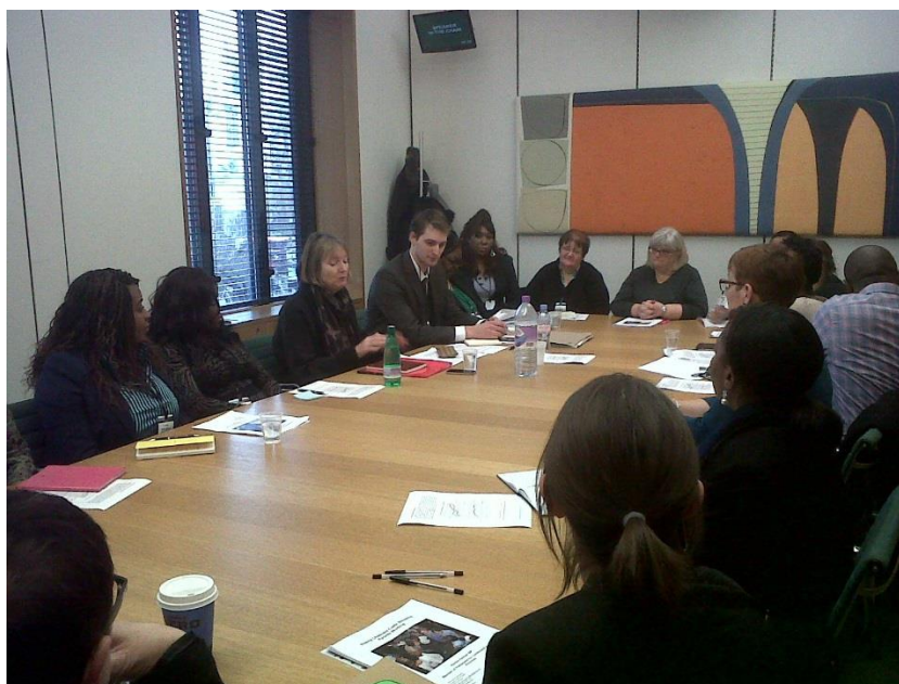
Childcare roundtable in the House of Commons

I convened a roundtable meeting at the House of Commons with over 20 local child care providers from Camberwell & Peckham and representatives from Southwark Council to discuss the cost and availability of childcare in the constituency. A number of important issues were raised including the rising costs of childcare and the impact this is having on working parents especially those on low incomes; the recruitment, training and retention of staff; and the difficulties these small businesses face finding funding for overheads and investment. You can read the report on my website: http://www.harrietharman.org/uploads/cbbce9b3-ea64-0854-1594-bbb4b1729bbf.pdf