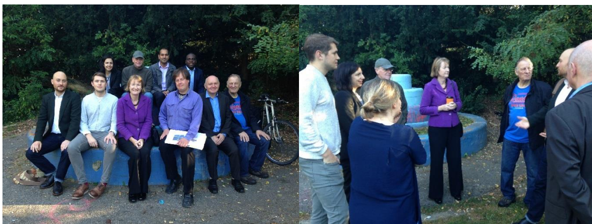
Local campaigners, councillors and T&RA representatives visiting the site of the old Lido

I'm backing the work to explore the option of re-opening Peckham Lido - one of the many lido's across London closed by Margaret Thatcher in the 1980's following cutbacks in government funding to local councils. The Lido opened in 1923 but was closed in 1987. The 180ft pool - situated at the northern end of the park - was not demolished but is currently hidden under dirt, grass and trees with a blue fountain the only sign it ever existed. I'm really encouraged by the possibility of using a derelict area and restoring it to its previous purpose. So far everyone has been positive. The next steps are to form the campaign group into a formal campaign association and commission outline plans to be looked at by the Council and for further consultation with local schools, businesses and the local community. The campaign has an on-line petition on change.org and more than 2,000 people have already signed it.