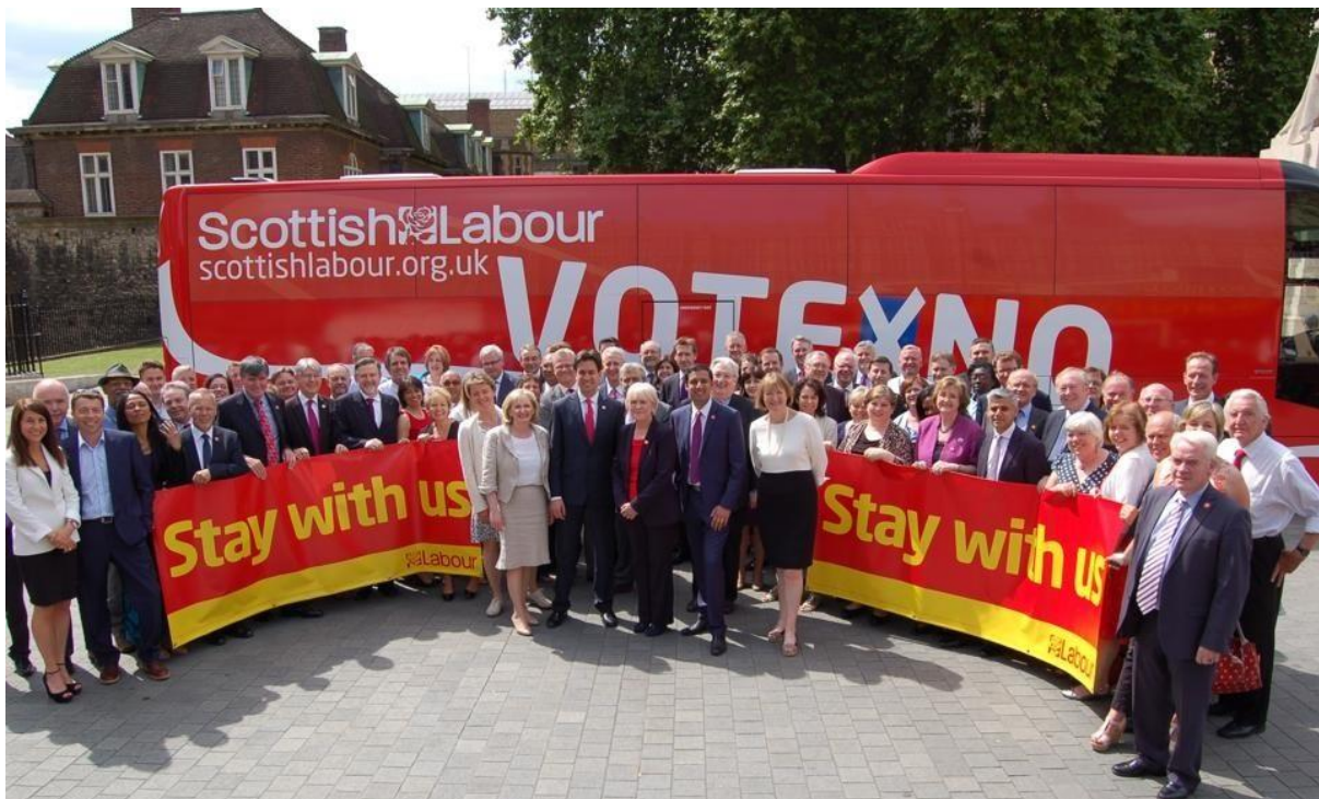
Better Together: Campaigning in the independence referendum

I stood in for Ed Miliband twice at Prime Minister's Questions in Parliament.