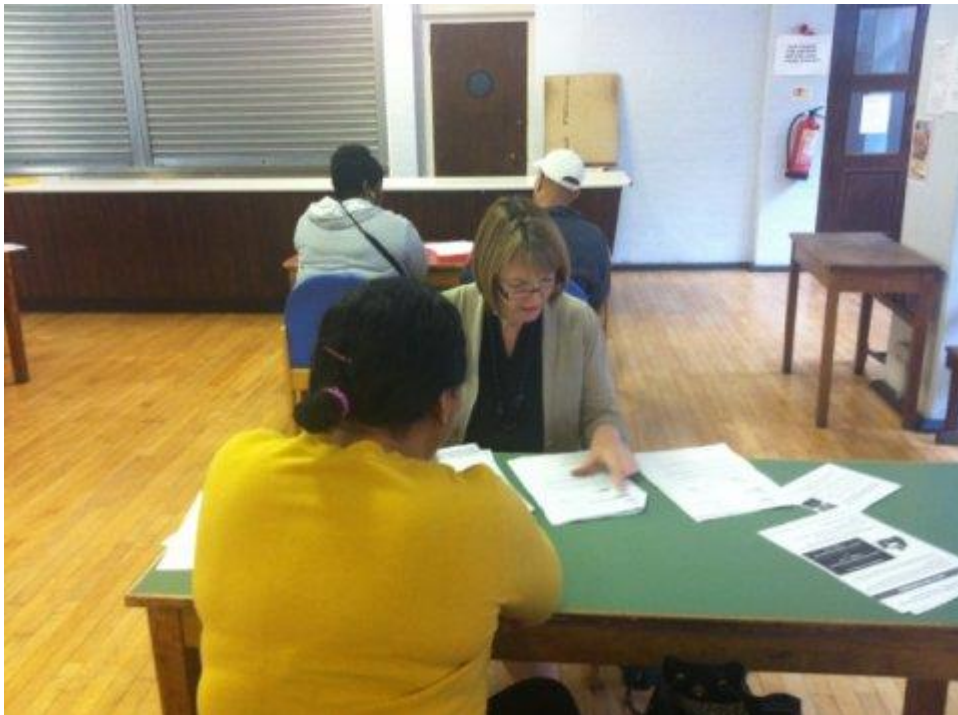
Advice surgery at the Walworth Methodist Church 'Clubland' in Camberwell

Casework enables me to help thousands of my constituents as well as keeping me in touch with the everyday, as well as the exceptional, problems they face.