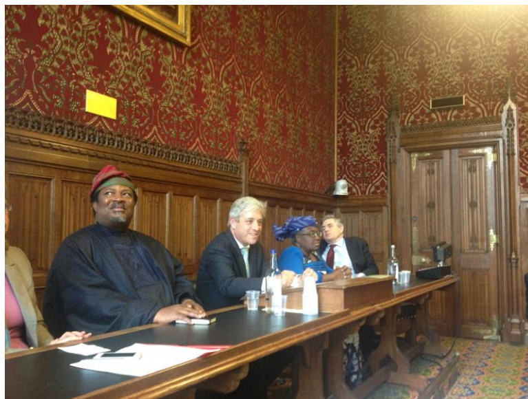
(From left to right) Nduka Obaigbena, President of the Newspapers Association of Nigeria; John Bercow MP, Speaker of the House of Commons; Dr Ngozi Okonjo-Iweala, Nigerian Finance Minister; Gordon Brown MP, UN Special Envoy for Global Education

In April 2014, over 200 girls were abducted from their school in northern Nigeria by a militant group called 'Boko Haram', who are against Western education and against any girl going to school. It was a privilege to meet Nigerian Finance Minister, Dr. Ngozi Okonjo-Iweala, when she came to speak in Parliament at a meeting convened by the UN Special Envoy for Global Education, Gordon Brown MP, on the Nigerian schoolgirls who were abducted from their school in April this year. It is essential not just for each child, but for Nigeria's economic future, that all girls in Nigeria go to school. We must keep up the pressure and support the Nigerian Government's efforts to bring all the girls home safely.