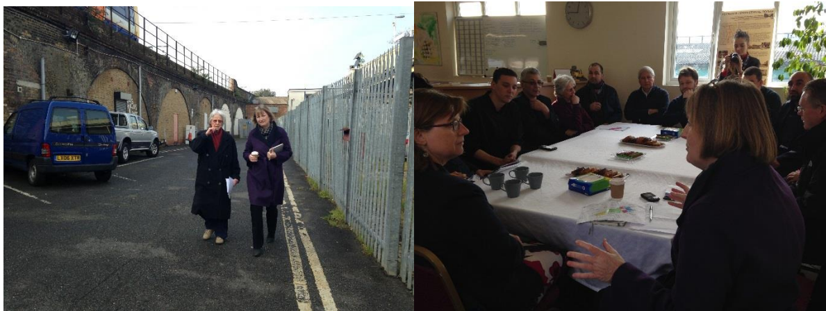
Peckham walkabout and listening to the views of local people and businesses at the Copeland Park Industrial Estate in Peckham