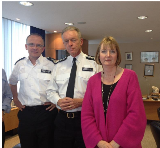
With the Met Commissioner, Sir Bernard Hogan-Howe and Assistant Commissioner Mark Rowley at New Scotland Yard

Myself, Tessa Jowell & Simon Hughes as Southwark MP's summoned senior Met police officers to a meeting and we demanded that lessons be learnt and reforms be implemented. Since then we have held regular meetings to monitor police progress. In May, I met the Met Commissioner, Sir Bernard Hogan-Howe and Assistant Commissioner Mark Rowley (Specialist Crime & Operations Unit), along with Simon Hughes MP, at New Scotland Yard to insist that he commission an independent organisation to conduct interviews with sex assault complainants at the end of the process to ask how the police handled their case. The Met has agreed to this and they will be reporting back to me the findings of the victims' views at our regular meetings.