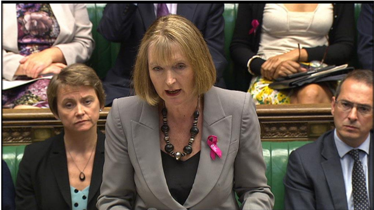
Challenging the Government at the Despatch Box

As Shadow Secretary of State for Culture, Media and Sport , I speak up for the importance of the arts, culture and sport; develop Labour's policies; and hold the Government to account.