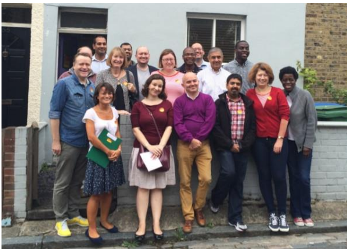
Campaigning with Camberwell & Peckham CLP members