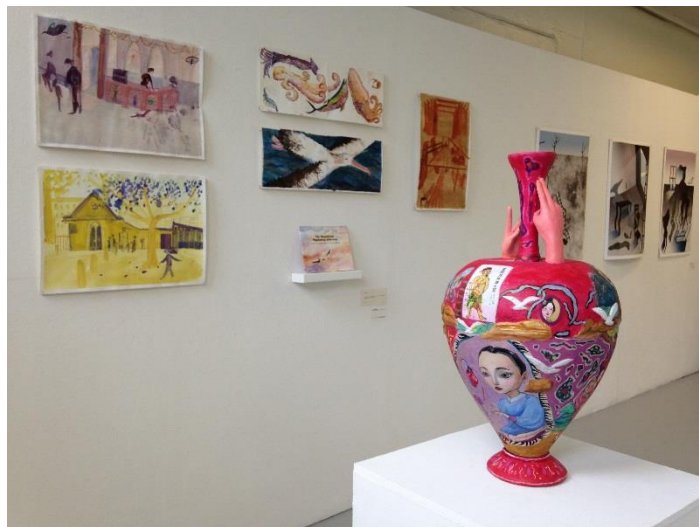
Graduate work on display at the annual exhibition at Camberwell College of Art

I'm pleased that Southwark Council included a pledge in their 2014 manifesto to award scholarships to local young people from low income backgrounds to study art foundation courses in Southwark. It is very important that we effectively support young people from the three schools closest to Camberwell College of Arts - Harris Academy Peckham, St Thomas the Apostle College and ARK All Saints - who would not otherwise be able to go, and that those awarded are representative of young people in local schools. I spoke at the launch of 'Peckham Platform', a voluntary organisation which works to increase local involvement in the arts, in support of their work with local schools including Harris Peckham.