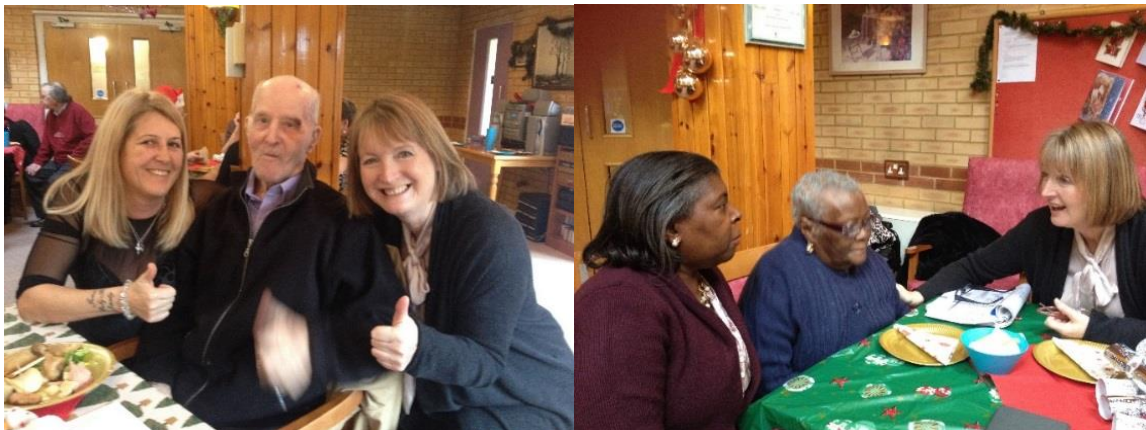
With local residents and their families at the 'memory café'

Dementia is one of the biggest challenges facing an ageing population and our health and social care systems and I'm very supportive of increasing the funding for dementia research, as well as support for dementia services. I visited the Alzheimer Society's 'Memory Cafe' for dementia sufferers to see first-hand the vital support available in the community for both dementia sufferers and their carer's.