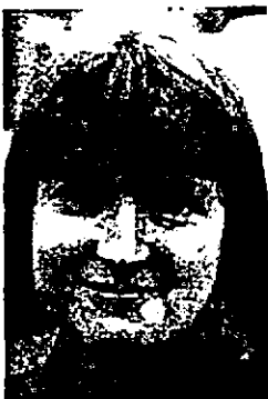
● MP Harriet Harman.

Around 87 people are now chasing each job vacancy notified to south London's job centres. In October 95 people chased each job in south London.