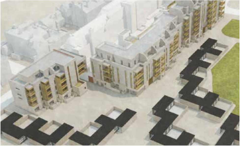
Designs for more and better homes on Knight's Walk