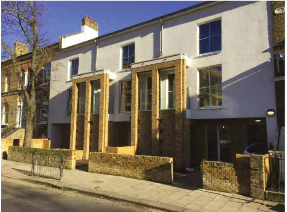
Akerman Road, in North Lambeth's Vassall Ward. Nine new homes have been created which embody the council's commitment to deliver more and better homes

This booklet gives you detailed information on the Key Guarantees, where they came from, where you can and more information and where to go if you have any questions.