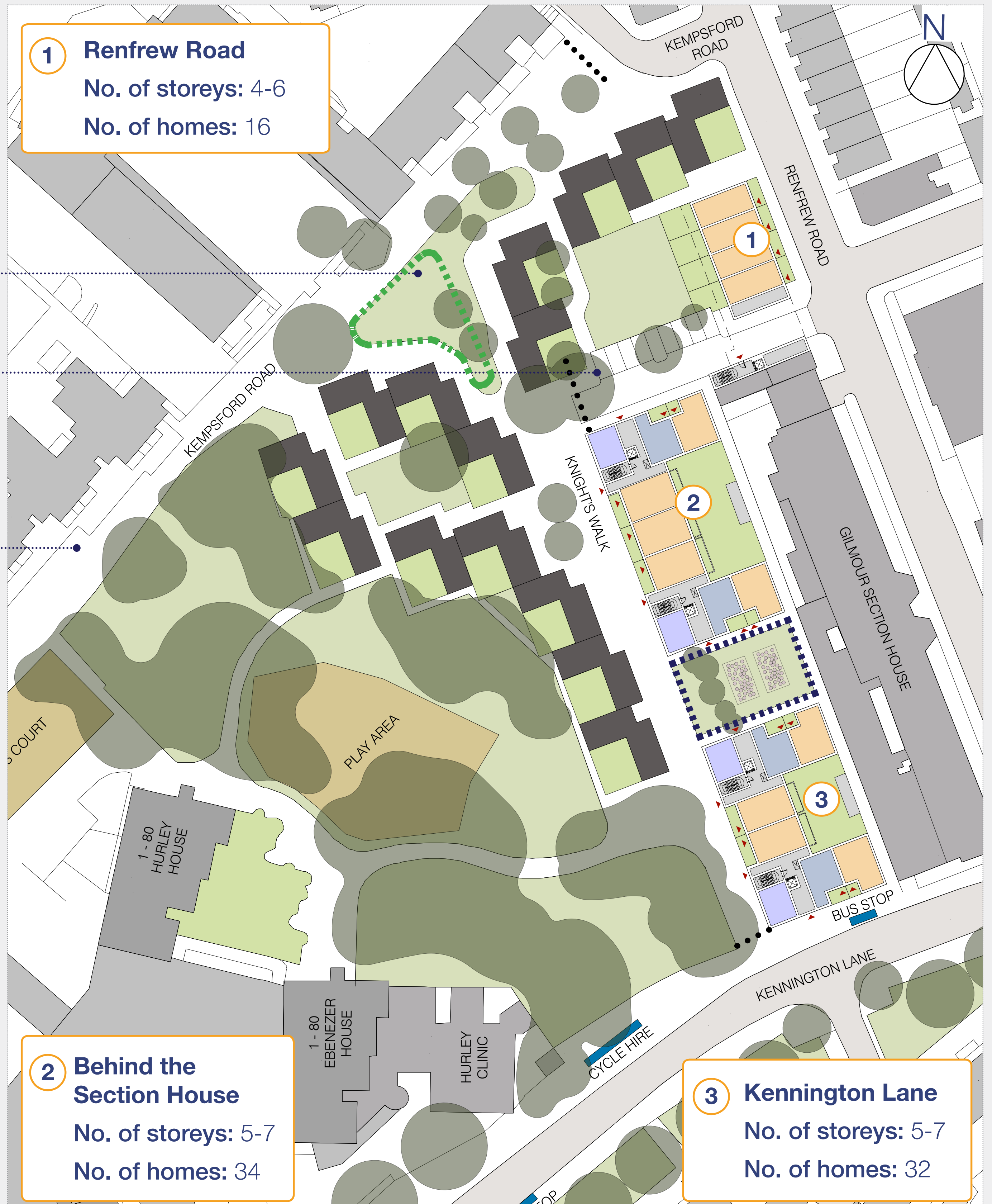
Scenario 2D - Partial Redevelopment Variation, Ground Floor Plan