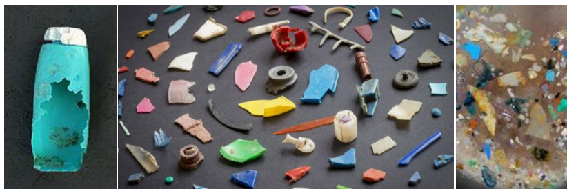
Left: What used to be bottles, toys and containers eventually turns into plastic soup.

Because the ocean is a cold, dark place, any decomposition happens slower in water than on land. Even food scraps can last up to two years. Plastic is extremely durable and doesn't biodegrade. Instead, it photo degrades from exposure to the sun. This means most commonly used plastics do not "go away" in the ocean within a measurable time frame, but continue to break up into smaller and smaller fragments until they are too small to see with the naked eye. Every piece of plastic that ever ended up in the environment is still around somewhere.