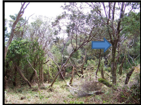
12 3.11.2004 – site immediately after brush cutting