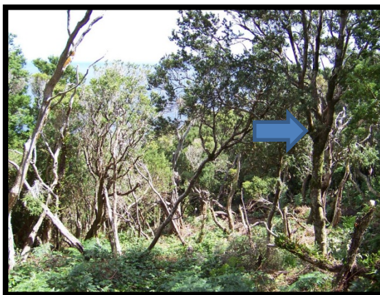
3 9.2.2005 the new blackberry regrowth was sprayed