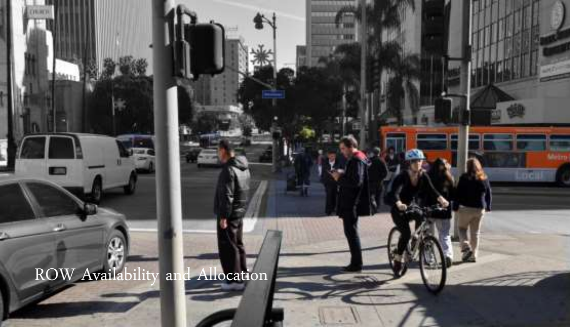
ROW Availability and Allocation