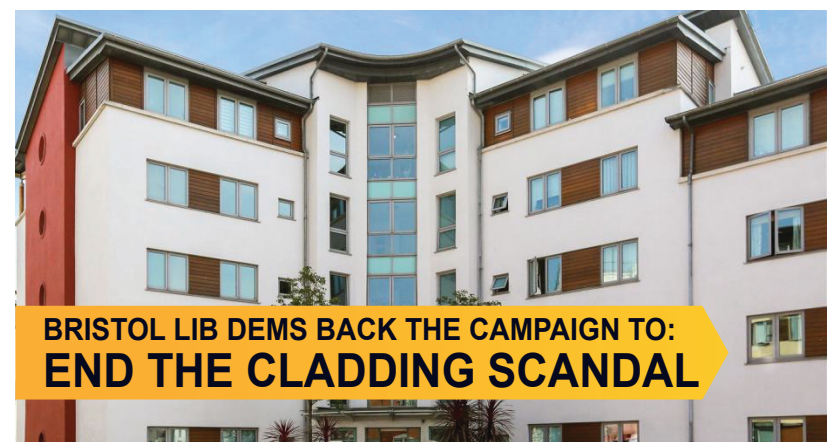
BRISTOL LIB DEMS BACK THE CAMPAIGN TO: END THE CLADDING SCANDAL

"Although this motion being passed is a victory, it will do little to calm the concerns of local residents. We will continue campaigning hard on this issue, working with our Lib Dem parliamentarians, lobbying local MPs and working with the relevant residents action groups to do everything we can to end the cladding scandal once and for all. "