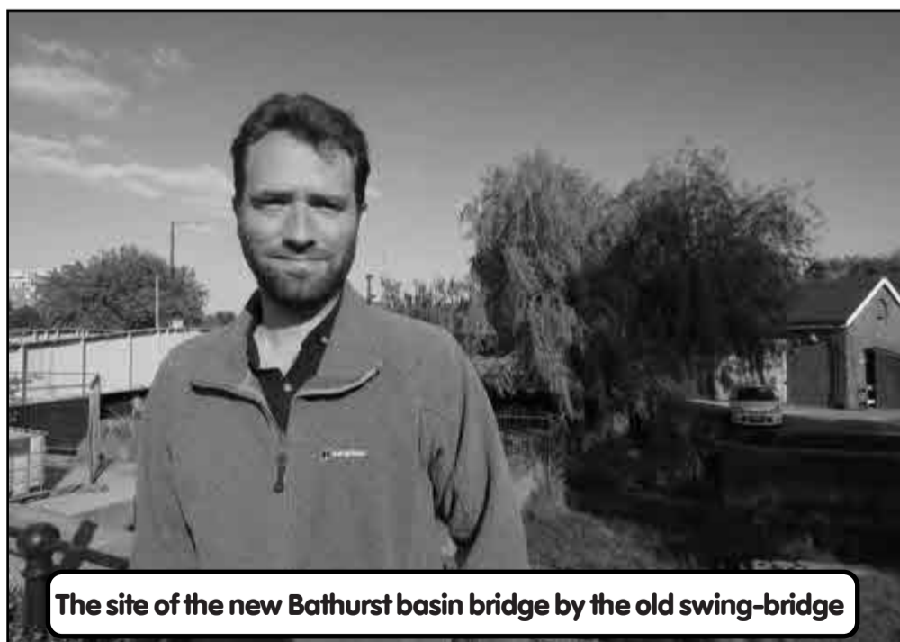
The site of the new Bathurst basin bridge by the old swing-bridge

The Council is also surveying Bathurst Basin to help design the new bridge there. The new bridge will improve capacity and provide a new shared footpath/cycleway. The shared path will create a continuous route along the Avon New Cut to the Chocolate Path. The existing bridge will carry east bound traffic. The new bridge will carry west bound traffic lane and the new shared space footway/cycleway.