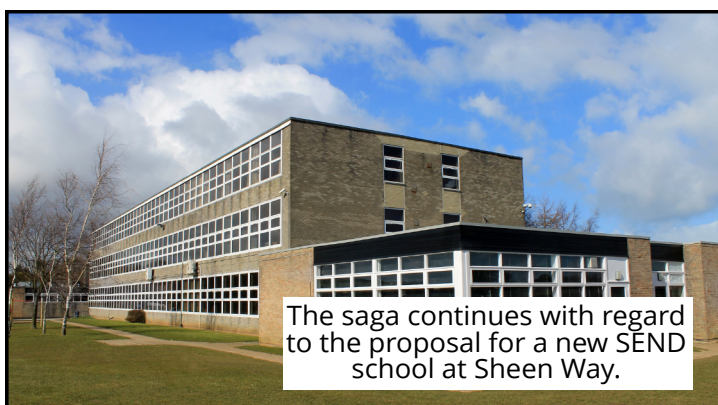
The saga continues with regard to the proposal for a new SEND school at Sheen Way.

The Government has already shown its blatant disregard of residents' rights to a say over development in their area with its significant extension of Permitted Development Rights, introduced without consultation. These rights now allow