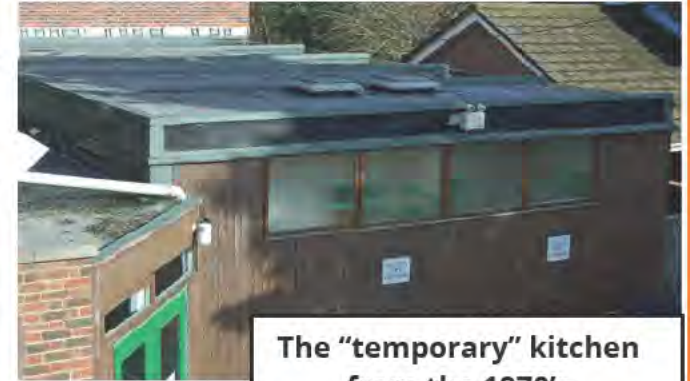
The "temporary" kitchen from the 1970's

The last major refurbishment of the Festival Hall was carried out over 30 years ago. Some areas are in need of repair and others of modernisation. The Town Council thought that there needed to be a long-term plan for the Hall.