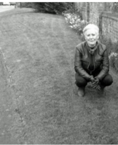
Above right: at St Peter's graveyard.

Left: this patch in Gainsborough Road has now been planted with yellow rattle, which weakens the grass to allow wild flowers to compete.