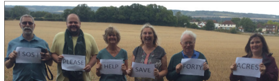
Local Lib Dems, along with residents and Parish Councils, worked hard against the Wates application for 250 homes on Forty Acres.