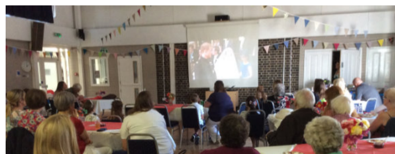
East Malling Community Centre roof repairs, internal & external decoration £3,725