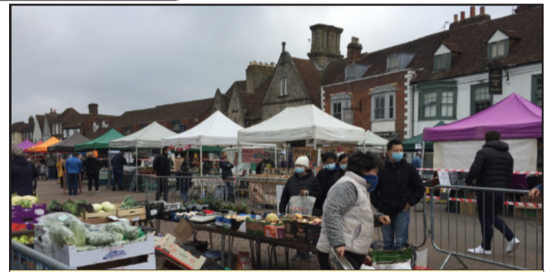
West Malling Farmers' Market for Covid signs and barriers to enable the market to reopen £1,890