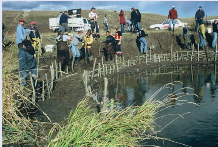
Wattle fence construction on West Nose Creek. The tools and techniques of bioengineering are quite simple, but the process can be labour intensive.