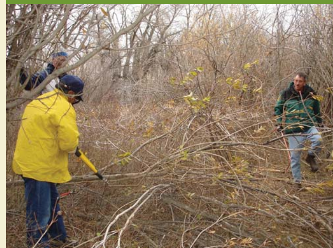
Loppers are used to trim branches from a stem. Trim all branches that are smaller than 2 cm.