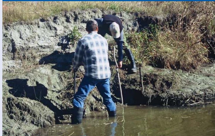
The initial row of live poles for wattle fences are placed near the water's edge. These poles are usually larger in diameter than the poles placed horizontally behind this row. Poles should be at least 80% underground as being demonstrated here.