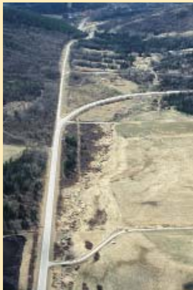
Multiple stream crossings, roads, clearing and drainage signal problems in this watershed. The cumulative effect of all land uses in a watershed contributes to more erosion.