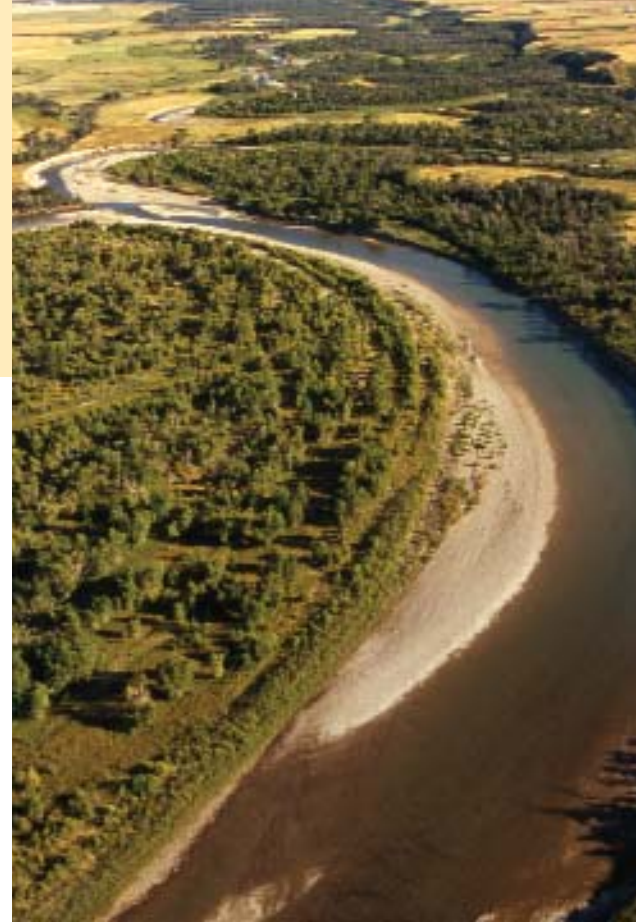
Trees and shrubs “glue” the riparian areas on streams and rivers together, reducing erosion.

Riparian areas are the green zones around lakes and wetlands, the emerald threads of water-loving vegetation that border rivers and streams, and the lush fringe in valleys. They are the edges, the borders and the transition zones that divide uplands from water. Riparian areas are called many things: shorelines, floodplains, bottomlands, bogs, muskegs, sloughs, wetlands, seeps, marshes, potholes and springs. What is common to all of them is a unique combination of water, soil and vegetation. Riparian areas buffer the effects of land use in the uplands from water, and protect uplands from erosion by water. The tiny bit of landscape called riparian traps sediment, stores water, reduces erosion and filters water. When all of the “ecological” functions mesh together in healthy riparian areas, we see forage, shelter, fish, wildlife, water and many more services produced. Protecting and managing riparian areas pays dividends, especially preventing erosion.