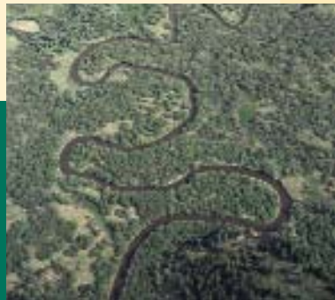
Streams meander to balance water speed, valley slope and amount of sediment transported. Straightening streams and removing vegetation increases the amount of erosion.