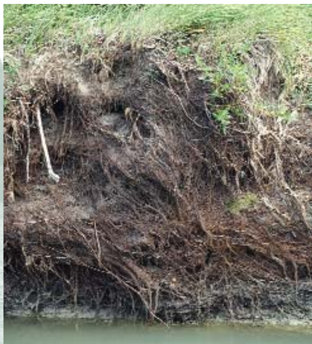
As the percentage of roots in streambanks and shorelines increases, there is more resistance and erosion decreases.