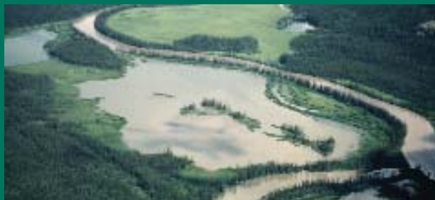
Floodplains, coupled with riparian vegetation, slow water down and reduce horsepower.