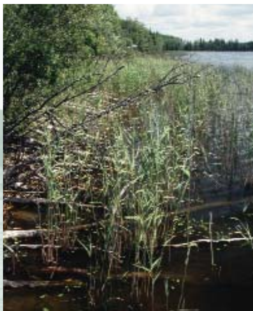
Riparian areas around lakes and wetlands include emergent vegetation in the water plus vegetation on the moister portion of the shoreline; both protect the shoreline from erosion by waves.