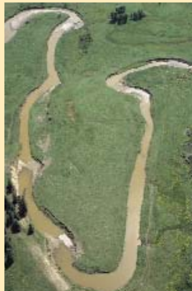
The loss of native vegetation, especially trees and shrubs, has resulted in more unstable banks on this stream. This stream has less ability to deal with erosion and to repair the damage will require restoration with appropriate riparian vegetation.